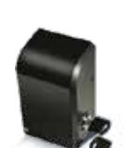
LATCH &amp; STOPPER